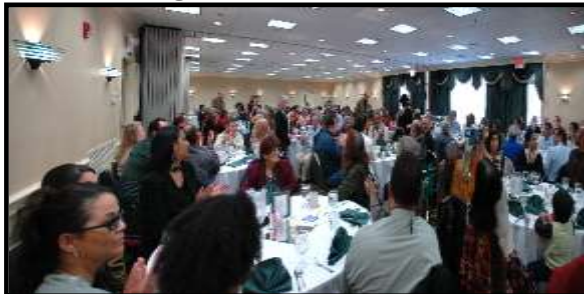
A full house at the 2008 MCNAA Anniversary Celebration

T he Massachusetts Center for Native American Awareness (MCNAA) celebrated it's 19 th Year Anniversary at the Holiday Inn – Randolph on April 6 th , 2008. The hard work of the President and the organizations' Leadership Team was reflected in the large attendance and the overwhelming success of our annual event. More