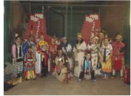
A small sampling of the dancers.

This year, Red Sox officials decided to honor team members who were born in other "Nations." During the first week of pre-game shows at Fenway Park, they had Dominican Day, Japanese Day, and Native American Day, and the following week was Puerto Rican Day. Since Jacoby Ellsbury is Navajo, the Massachusetts Center for Native American Awareness (MCNAA) and another Massachusetts Native organization was contacted to participate.