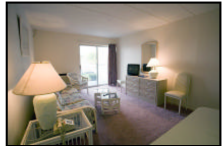
Living Room.